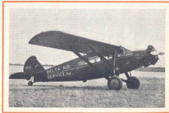
One of the Fleet

Traveling by air delivers the business man safely at his destination in one-third to one-half the time required by railway schedules. It cuts in half the costliest waste in business—time lost in travel. It doubles productive hours, speeds sales and increases profits.